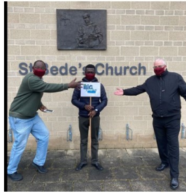
Many thanks to all those taking part in the Walk for Water Lent challenge and to everyone who has sponsored them.