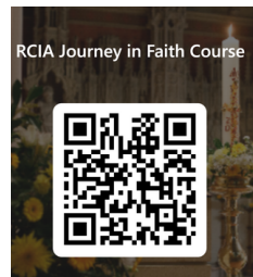
RCIA Journey in Faith Course